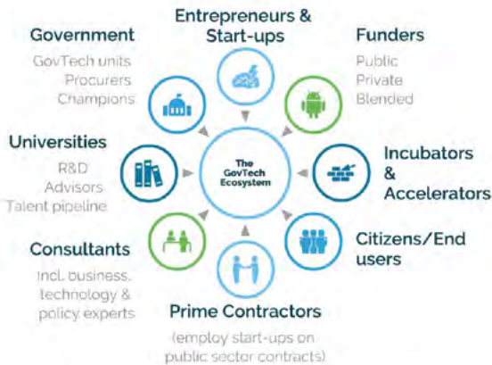
ILLUSTRATION 1. The GovTech Innovation Ecosystem

*Represents the principal organisations and individuals but is non-exhaustive. Main subcategories in grey. 'Champions' are high-level sector advocates.